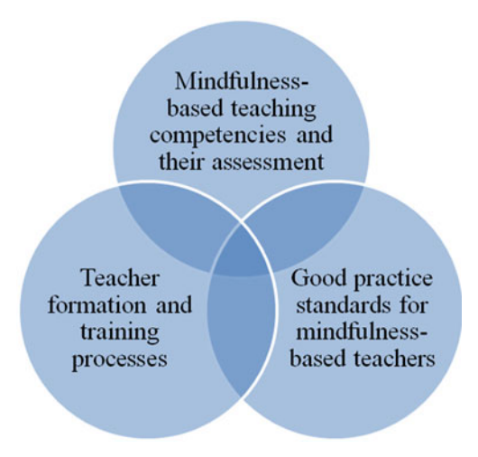
Fig. 1 Working model of three interconnected aspects of quality and integrity in teaching mindfulness-based courses

In an initial publication, we articulated the principles underpinning our training processes (Crane et al. 2010). The UK Network for Mindfulness-Based Teacher Trainers, which represents all the main UK training organisations, has developed and disseminated national Good Practice Guidance on standards for mindfulness-based teachers (UK Network of Mindfulness-Based Teacher Trainers 2010). These guidelines focus on the practical implications for teachers of the underlying ethical principles and values of